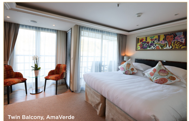
Twin Balcony, AmaVerde