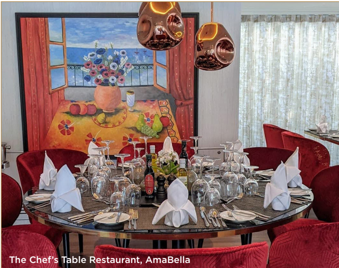
The Chef's Table Restaurant, AmaBella

Newly reimaged in 2021, the AmaVerde and AmaBella boast a unique custom design, multiple dining venues and exclusive amenities that make these ships unlike any other on the world's greatest waterways. The 160-passenger ships feature our signature twin-balcony staterooms and suites, each with a French Balcony for unimpeded views and fresh air, plus a separate outside balcony for private enjoyment.